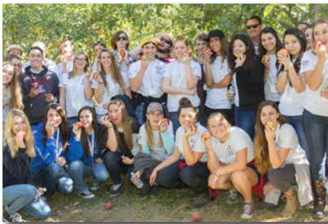
TLT students from West County Schools take a bite out of an apple that they have picked straight from the tree at Dutton Ranch in Graton. Many of the students have never had the opportunity to pick and eat an apple from a tree before.

In October, Farm Bureau Foundation of Sonoma County along with Farm Bureau sponsored three agriculture days for students participating in the Tomorrow's Leaders Today (TLT) program. The first two tours hosted high school students from Santa Rosa City Schools and the third tour included students from West County Schools; each tour presented aspects of agriculture to approximately 40 students. The TLT program educates high school juniors about Sonoma County issues through hands-on learning, critical thinking and communication. The students have begun thinking about future careers and TLT allows them to meet decision-makers and discover what careers might be best for their future. The Foundation has been a sponsor of the TLT program since 2012.